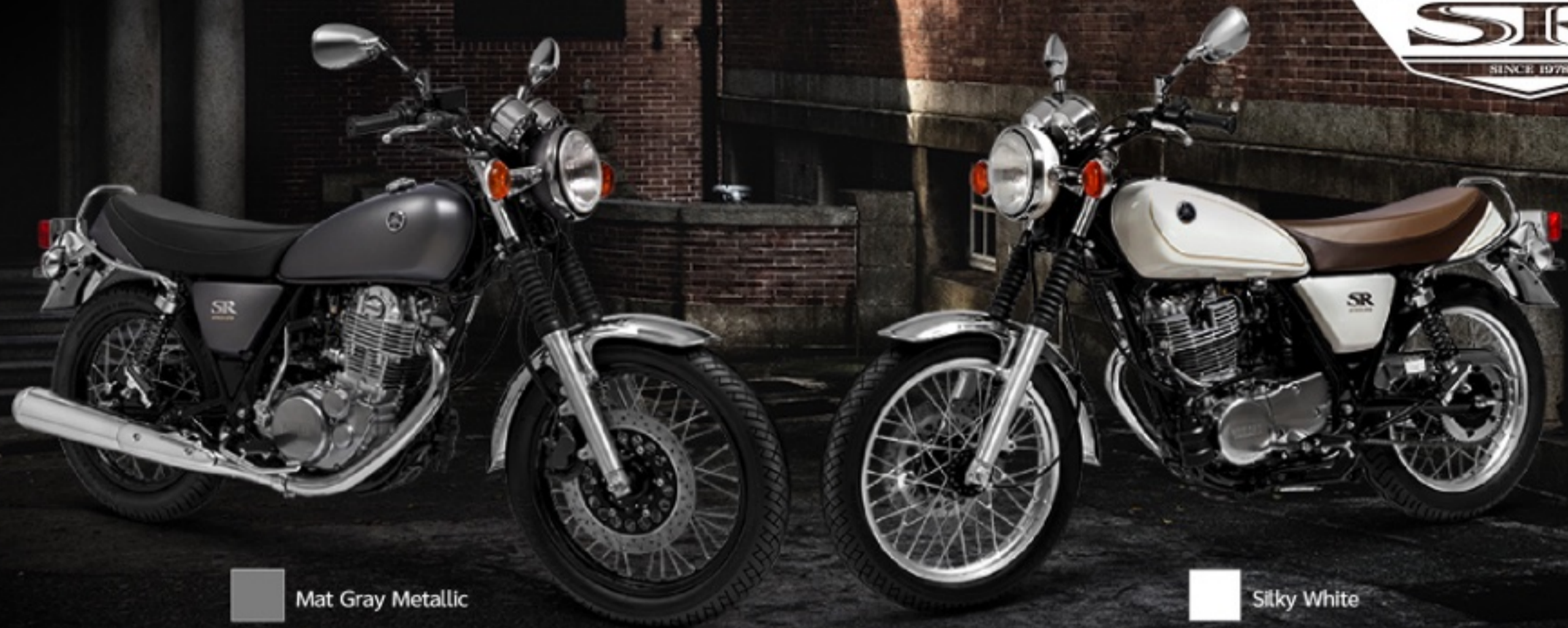
Mat Gray Metallic